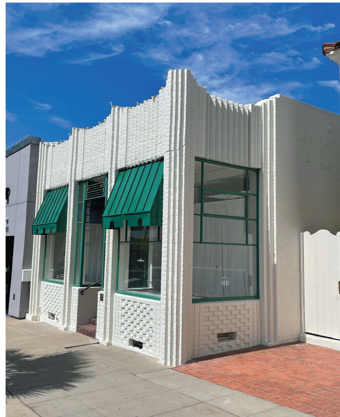
Refurbished façade to the Parker Building, where fall classes will be held

students alike feel secure in our newly restored world. As we move forward, we would like you to know that your loyalty and support are of paramount importance to the school. Thank you for both. Please come back and see us often.