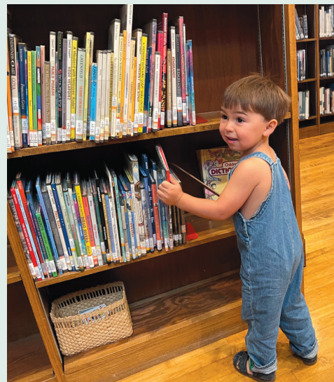
Storytime on Wednesday afternoons is back at the library—as attested by these two cuties perusing the Young People's Collection