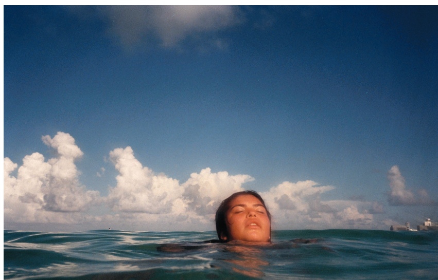
The artist in her art

Under the program, students learn art and bookmaking techniques, and through engagement with working artists, learn about careers in visual arts. The project culminates in presentation of the students' final product through reading of the books to community members in the park, as well as to families and community members in the AAC's main gallery. For more information or to register a student, visit ljathenaeum.org/levelup .