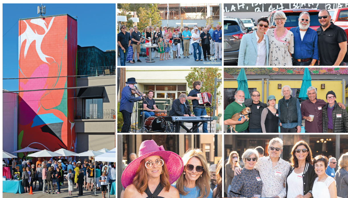
Scenes from past Annual Parking Lot Parties, including artists whose works are represented in the Murals of La Jolla