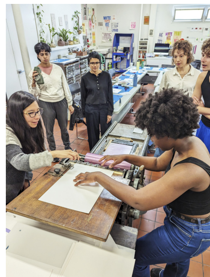
Open Print Studio is open to all ages.

The AAC held two successful art receptions in May, the Mothers' Day pop-up on May 13 and the Faculty Exhibition on May 20. The latter show will be on view through August 5.