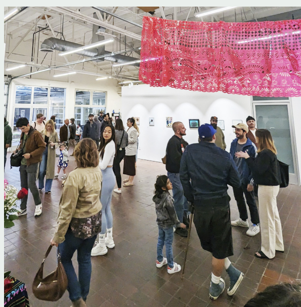
A crowd enjoys the art and festivities to welcome Mother's Day weekend at the Athenaeum Art Center during the Barrio Art Crawl.