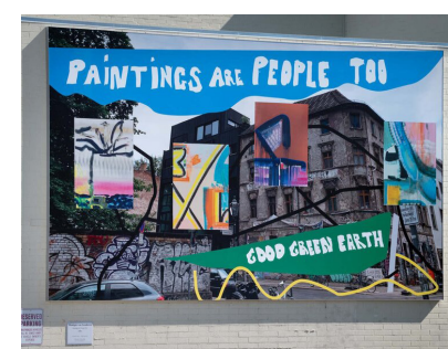
The several paintings in Van Genderen's mural are stand-ins for people.

Tickets are $15 for Athenaeum members, $20 for nonmembers, and $5 for students. For tickets and more details, contact us at 858-454-5872 or l Athenaeum.org/special-lectures .