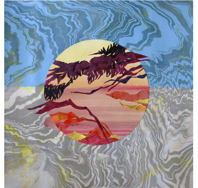
Eva Struble, Fidalgo , 2023 Acrylic, pencil, and collage on paper, 18.75 x 18.75 inches Commissioned for 2023–2024 Music Program Cover (22nd) Athenaeum Permanent Collection, 2023.01

The Athenaeum is pleased to announce the artist for its 2023–2024 concert program cover: Eva Struble. Struble drew a large number of visitors to the Athenaeum to see her colorful and inventive exhibition, Midden , at our library from January 14 through March 4, 2023.