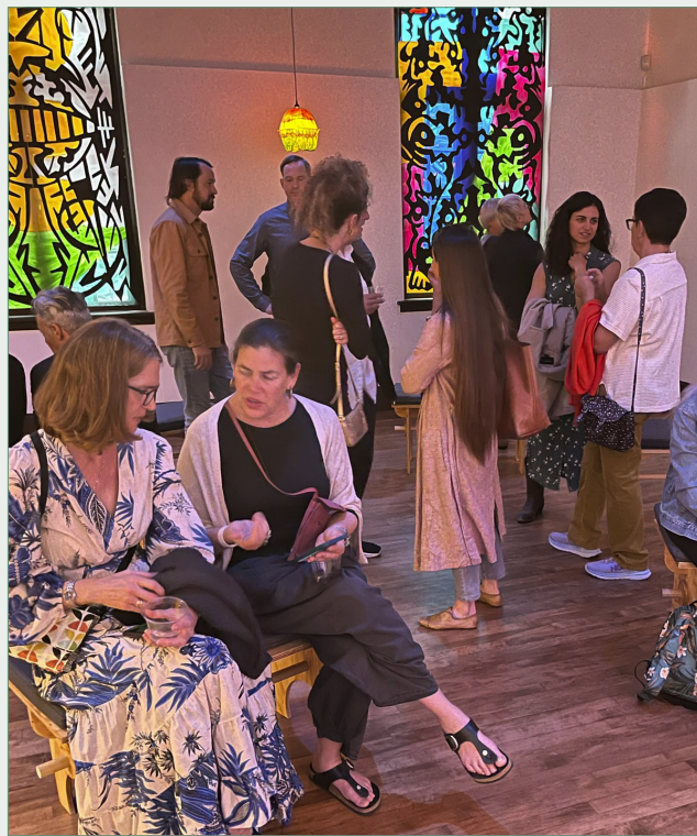
Fans enjoy sitting in the glow of the coruscating windows.