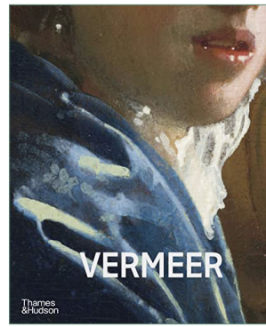
The Vermeer catalog includes more than half of the artist's known works.

Tickets for the exhibition sold out quickly, and it recently ended on June 4. However, if you did not have the opportunity to travel and view the show in person, the Athenaeum has added to our collection the definitive Vermeer catalog that accompanies it ( 759.9492/V592v ).