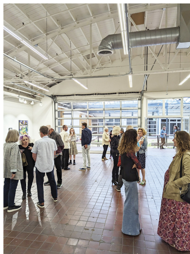
The Faculty Exhibition reception at the AAC. The show recognizes the talented artists who teach in the Athenaeum's School of the Arts, both in La Jolla and Logan Heights.