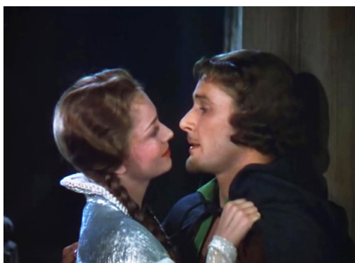
The Adventures of Robin Hood opens the series.