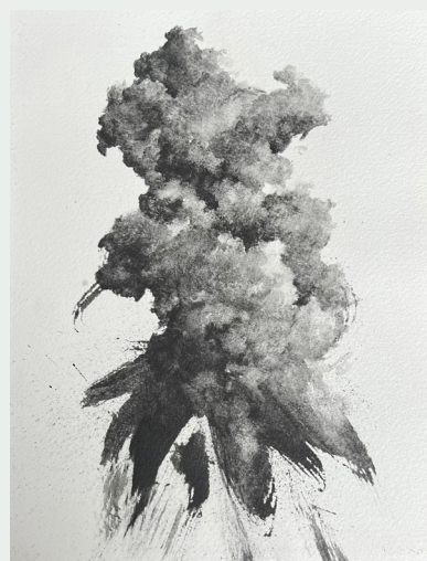
Tatiana Ortiz-Rubio, 1:43pm , 2022 Graphite and water on paper, 10 x 8 inches Athenaeum Purchase, Commissioned for 2023 Patron Gift (30th) Athenaeum Permanent Collection, 2023.04