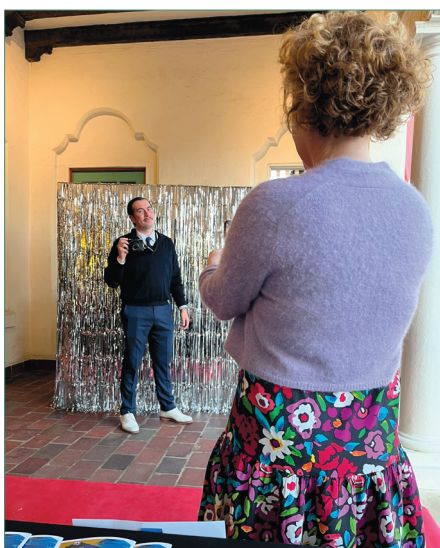
Meta-moments are made of these: a photo of a photographer photographing a photographer.