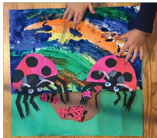
An image in a child's stop motion process taught by Emily Grenader.

A workshop that will be held at the Athenaeum Art Center's studio in Logan Heights is June Rubin's Around the World—Kids Camp for ages 7–13. This course will take place 9 a.m.–12 p.m., July 10–14. The class is $225 for Athenaeum members and $245 for nonmembers with a $20 materials fee.