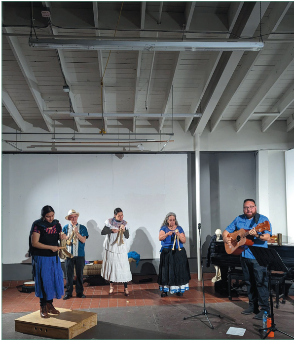
Son de San Diego performs the traditional son jarocho of Veracruz, Mexico.